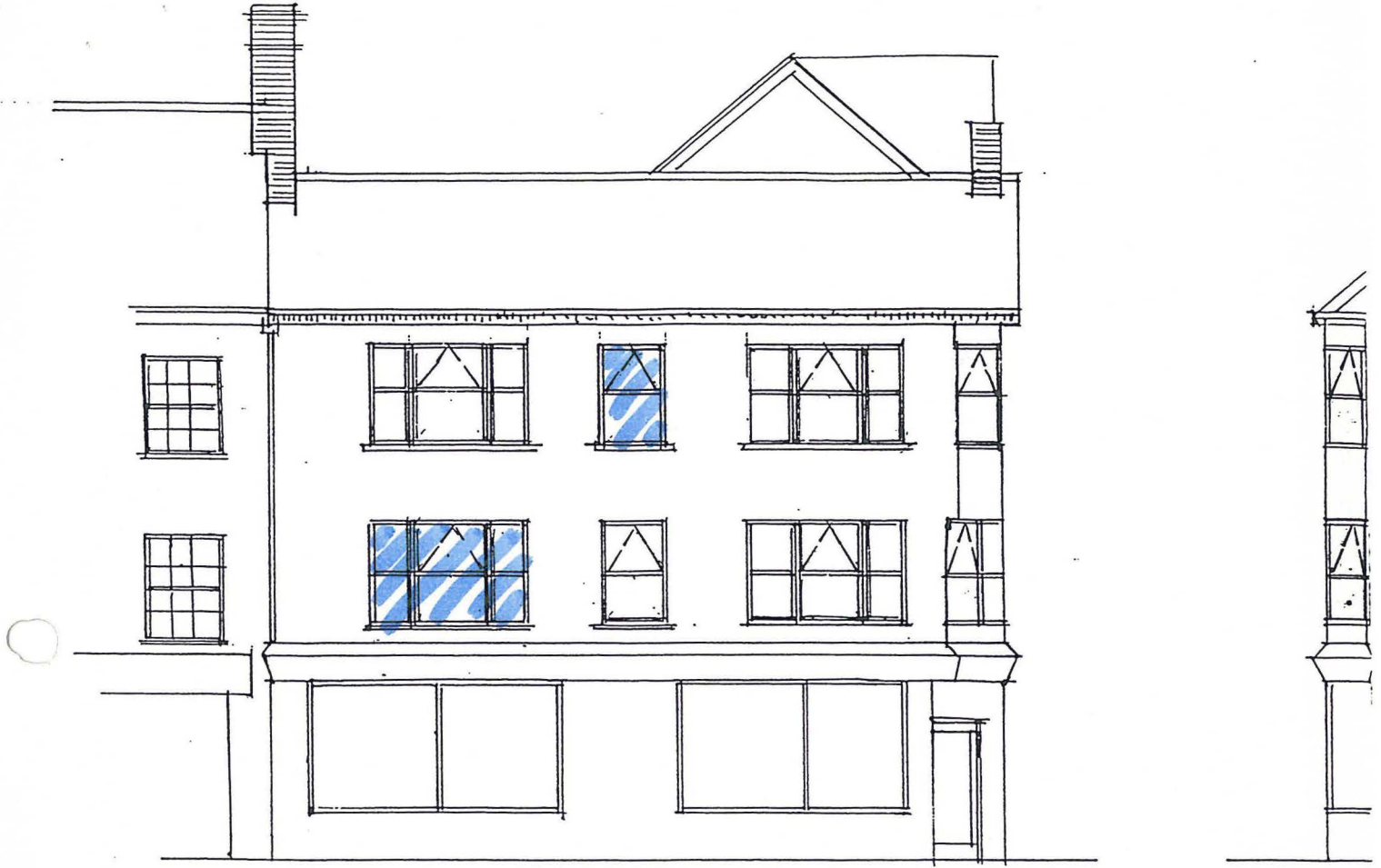
ELEVATION TO BOUTPORT STREET

PROPOSED REPLACEMENT OF WOODEN SASH WINDOWS WITH WHITE UPVC CASEMENT WINDOW: AT NOS 30 BOUTPORT STREET