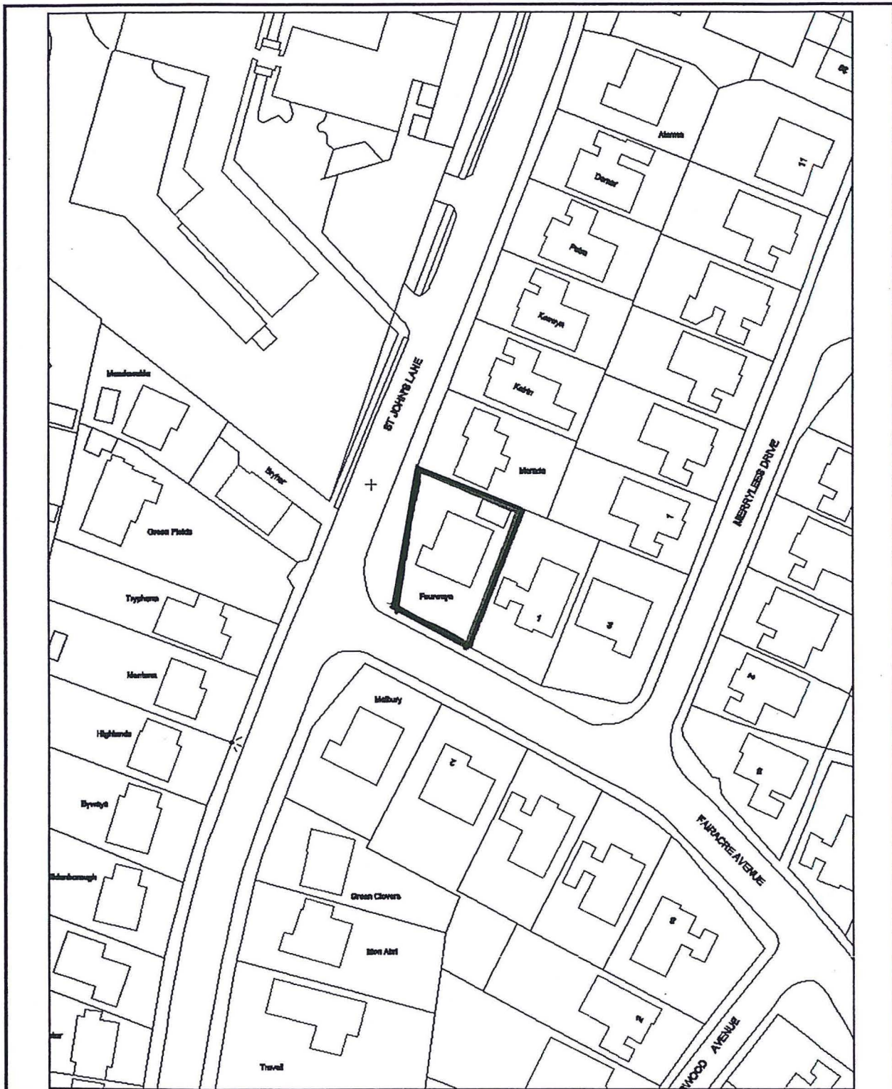
FOURWAYS - Scale: