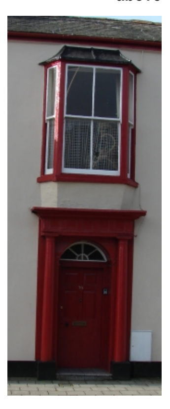
Street with fanlight and Oriel window above